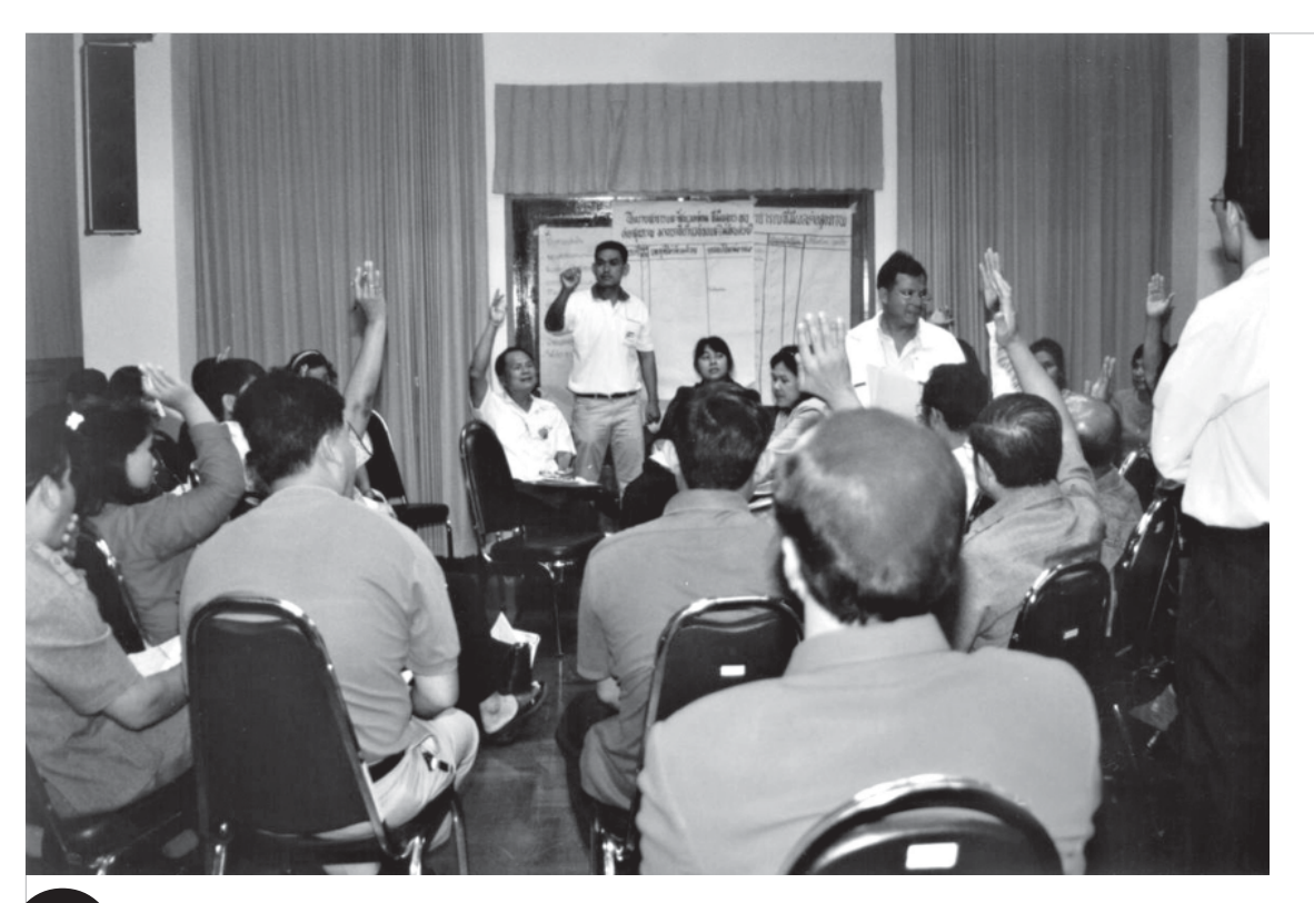
Regardless gender or religion, ordinary citizens made their voice heard at civic forums.

encouraged local people to rethink and reclaim their active roles in determining the characteristics of the national health system. The process of deliberation was an active learning process in which people came to understand themselves as active citizens and not just passive subjects of the state. This civic education was evident in how the process brought about deep contemplation and collective reflection on issues such as the values of local indigenous healings or the social origins of diseases, and the needs of healthy public policies.