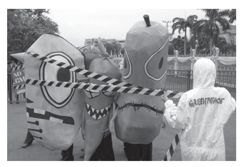
Green Peace uses campaign and media to mobilize public opinion against unsustainable agriculture.

Not only the financial support for nonprofit organizations increased in the last two decades, these organizations became much more effective than many international bureaucracies. Amnesty International and Human Rights Watch, for instance, have created great impact and have already changed state human rights practices in a number of countries. Green Peace International's media facilities and communication networks were extremely effective; it even had its own satellite link. Through its extensive communication networks, the organization could send out photographs to newspapers