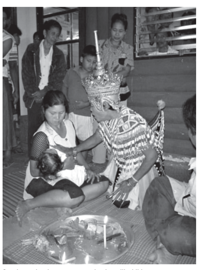
Southern ritual ceremony to heal an ill child.

It was within this colonial context that Siam undertook modernization. Colonial Britain was forcefully making its way into