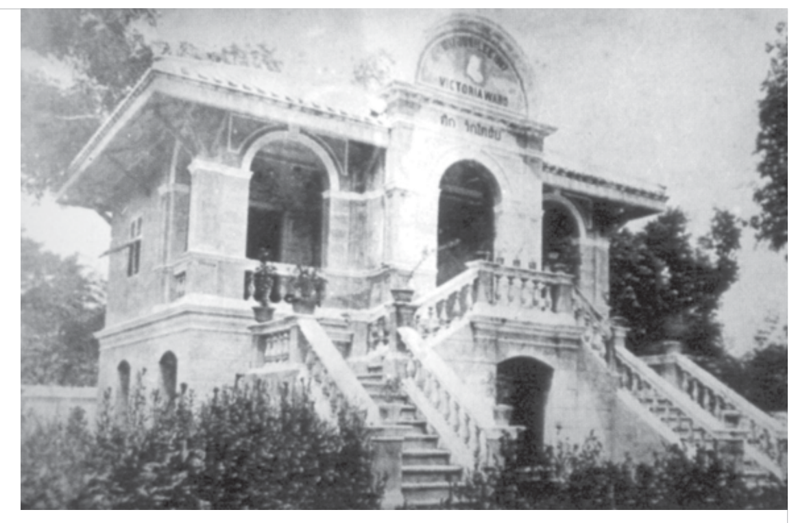
Victoria Building was for elite patients in the early stage of Siriraj Hospital.

During recent decades, Thailand has witnessed progressive development in health status. National health indicators have shown significant improvement. The life expectancy at birth of Thai people