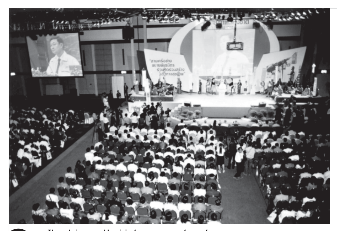
Through innumerable civic forums, a new form of public life merged as shown at the National Health Assembly in 2002, attended by a then-Prime Minister.

systems reform, was published by the HSRO. The meetings at various levels as well as the newsletters served to engage the greater public and to build consensus on the desirable health systems among various people.