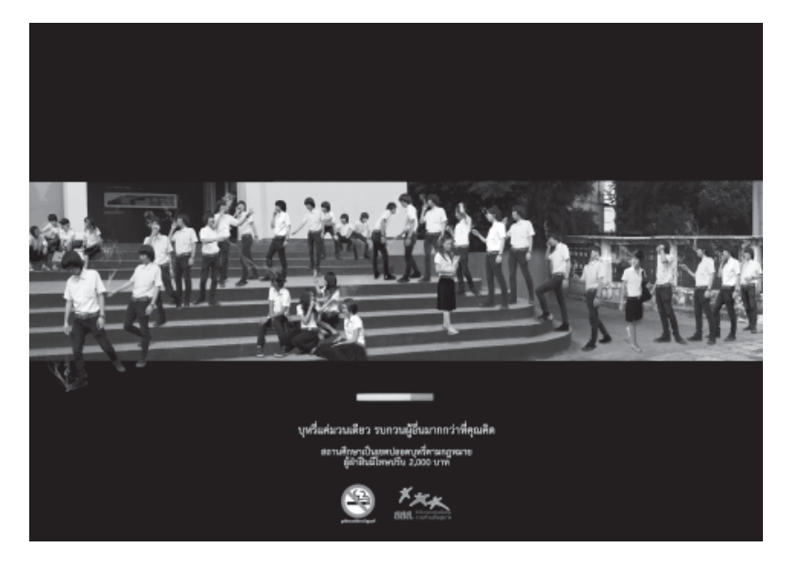
A successful anti-smoking campaign has been launched for 20 years in Thailand.