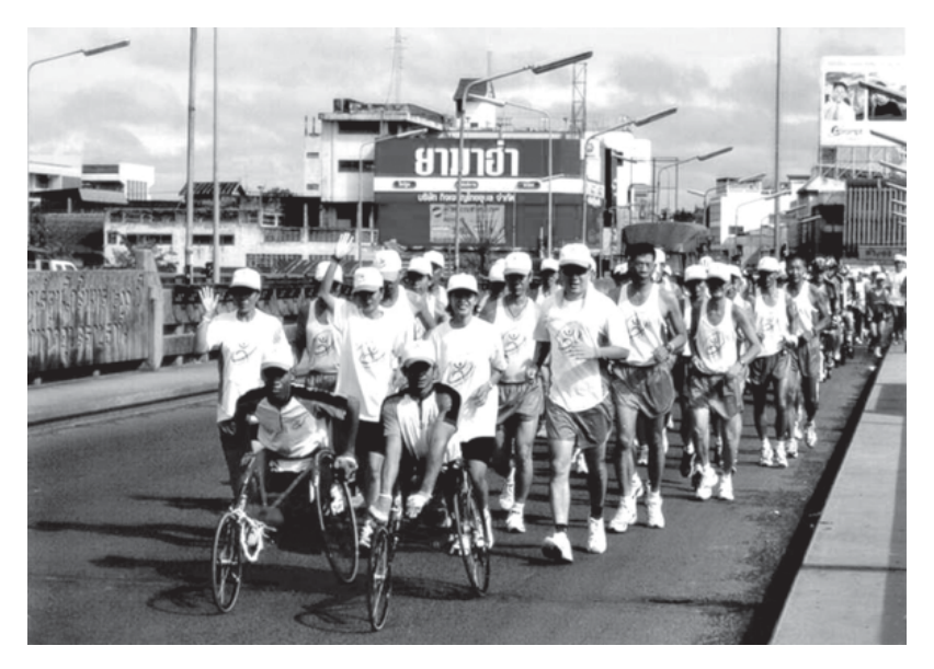
A running campaign for the draft National Health Bill reflected the effort of civic community to achieve democratic form of governance.

gather popular support for the bill. According to the new Constitution, ordinary citizens can propose a bill directly into the parliamentary process. Although the procedure requires 50,000 signatures, the organizers of the campaign expected to get 500,000 signatures to show strong support from the public. The closing stage of the campaign would coincide with the general elections in 2005. The civic network was not very optimistic about the outcome for the bill, but several argued that the oucome was less important than the process as part of the effort to achieve a truly democratic form of governance,