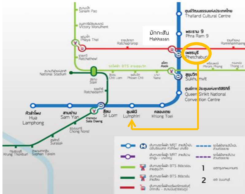
Picture 2: Bangkok Metro (MRT) Map, 'Phetchaburi Station' to 'Lumpini Station'

Step 2: Exit the ARL at 'Makkasan Station' and make an interchange with the Bangkok Metro (MRT) Blue Line to connect 'Phetchaburi Station' (about 450 meters by walking). Take MRT ride to 'Lumpini Station' and use the Exit No. 1. Please wait for ThaiHealth shuttle van at the bus stop down the Exit No. 1. Our shuttle van will pick up every 15 minutes. Or use the Exit No. 2 for taking a public metered taxi which takes around 5 minutes with the approximate 50-70 THB fee to ThaiHealth Center. (See picture 2) (For more info, please see https://www.mrt.co.th/en/mrt-route/11076 )